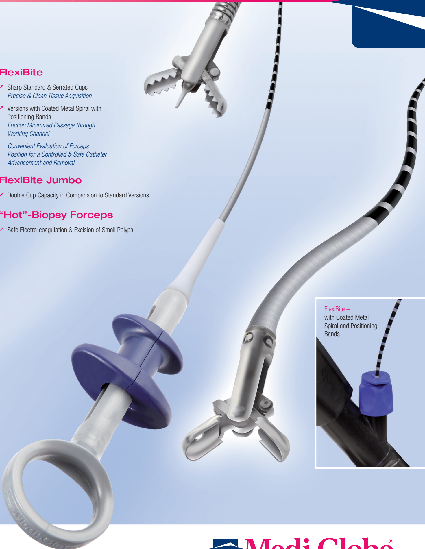
FlexiBite – with Coated Metal Spiral and Positioning Bands