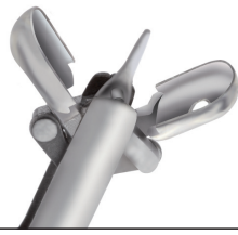
Oval Cups with Spike