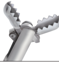
Serrated Oval Cups